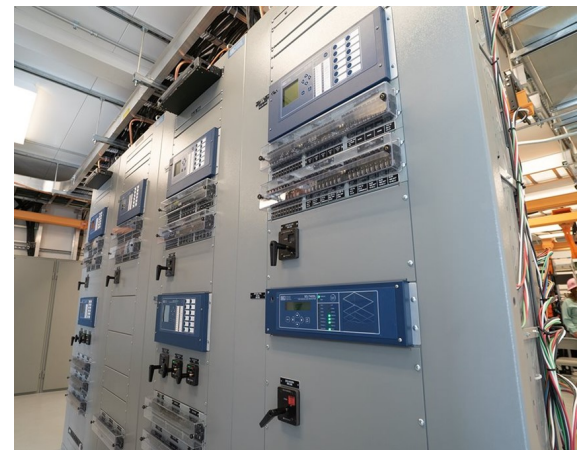
SEL-T400L relays installed in the substation

As our power system continues to evolve, SEL will be at the forefront of protection and control development. Alongside them, real time simulation will continue to play a role in building the confidence to deploy novel systems.