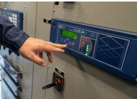
The SEL-T400L represents a major step-change in power system protection

The Public Service Company of New Mexico (PNM) was building an interconnection on a series-compensated 345 kV line. Splitting the line resulted in heavy overcompensation of the first portion, leading to improper coordination and misoperation of protection schemes.