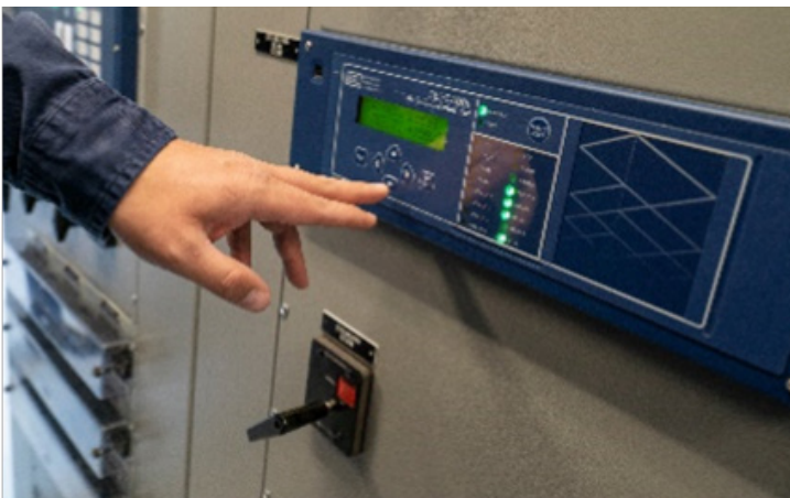
The SEL-T400L represents a major step-change in power system protection.

The Public Service Company of New Mexico (PNM) was building an interconnection on a series-compensated 34 kV line. Splitting the line resulted in heavy overcompensation of the first portion, leading to improper coordination and mis-operation of protection schemes.