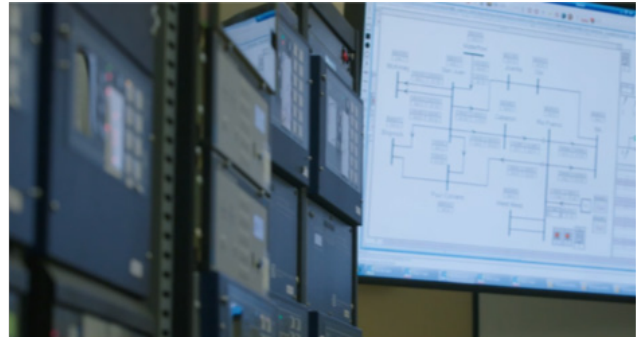
A network simulated with the RTDS Simulator is interfaced with SEL relays.

The RTDS Simulator is used to represent the power system of interest, which is then connected to SEL's protection, automation, and control devices in a closed-loop interface. In this way, the proposed solution can be exposed to a wide variety of operating scenarios and contingency conditions, providing performance assurance to both SEL Engineering Services and the client.