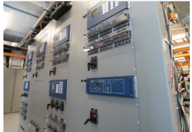
SEL-T400L relays installed in the substation

LEARN MORE ABOUT TRAVELLING WAVE PROTECTION TESTING IN OUR KNOWLEDGE BASE AT KNOWLEDGE.RTDS.COM