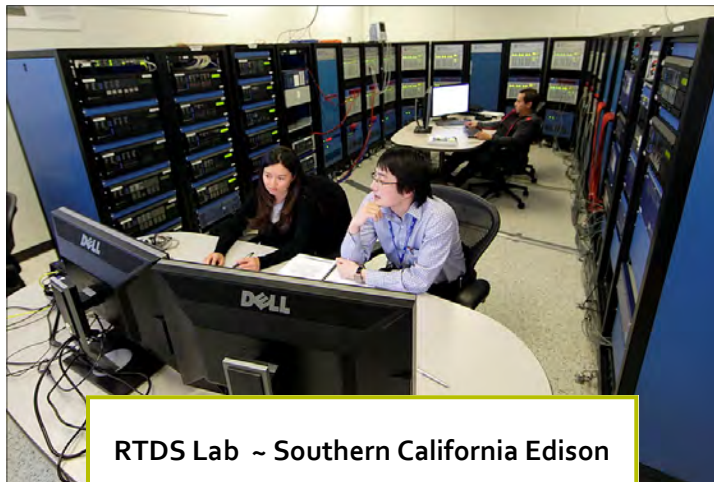
RTDS Lab ~ Southern California Edison

Southern California Edison (SCE), one of the largest electric utilities in California, has recently expanded their RTDS real-time power system simulator to 20 racks using the latest generation of processor cards. The expanded RTDS is housed in SCE's new